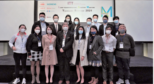
Group photo of the LAMTS 2021 Organizing Committee