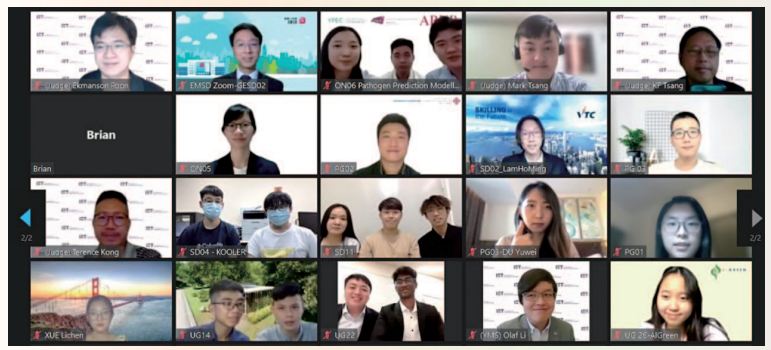
Group photo of the Closing Ceremony 1