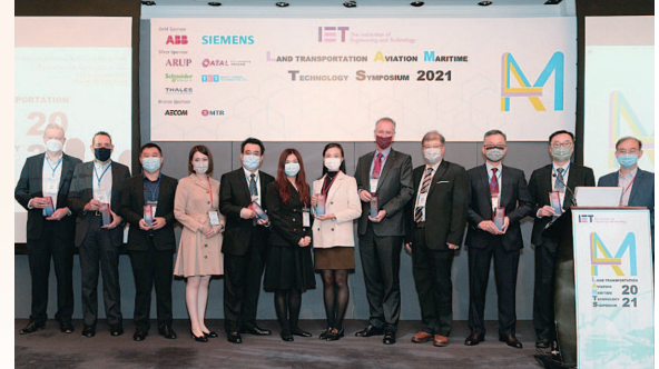
Group photo of the LAMTS 2021 issue a commemorative crystal to the sponsor