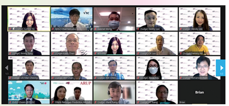
Group photo of the Closing Ceremony 2