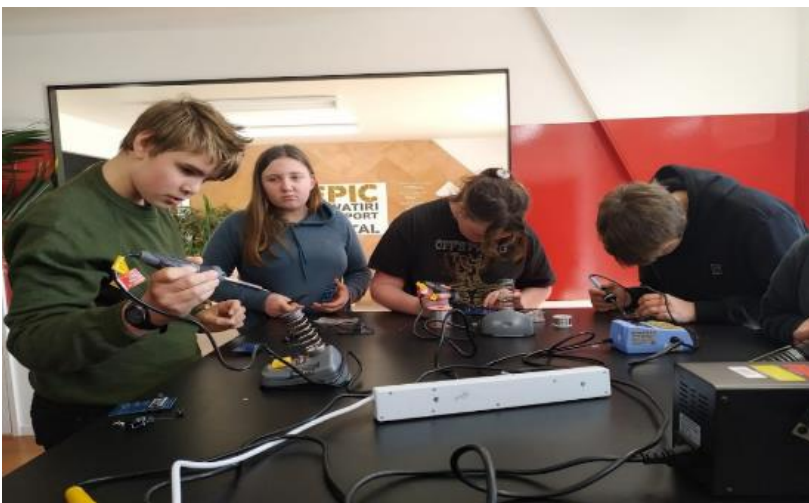
Buller High School students gather around the soldering stands to build their workshop projects