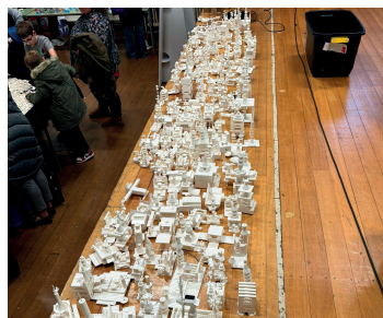
The Stage of Fame – models of the future made during the day