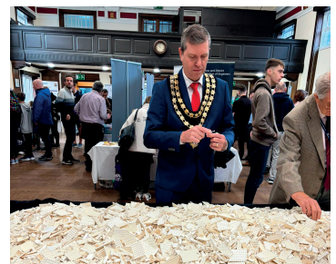
Ulverston Mayor Councillor Graham Scrogam looks to the future